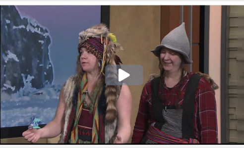
Snow Sculpting Team Canada

By KSTP Updated: January 14, 2025 - 10:42 AM Published: January 14, 2025 - 8:15 AM